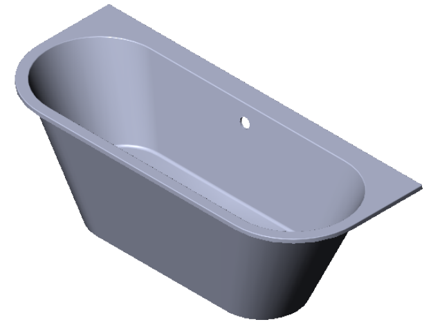
C (1 : 5)